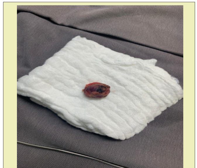
Figure 4: Surgical piece. Macroscopic sample of head insulinoma of the pancreas is shown.

Insulinoma is characterized clinically by the appearance of hypoglycemia, which must be confirmed by the Whipple triad consisting of: